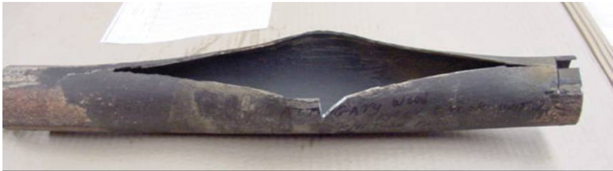
Creep-rupture failure of boiler tube

CC Technologies plans to host a project kickoff meeting during September 2006. Those who complete and submit the form below or the form on the Internet will receive an invitation to attend that meeting.