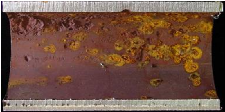
Internal corrosion pitting of boiler tube

Waste-heat boilers used in ammonia and related types of process plants are prone to unexpected failures. These failures typically result in unplanned plant shutdowns for repair and/or emergency maintenance work. This work and the lost production are costly for the plant operator. Therefore, it is desirable to increase the reliability of waste heat boilers while maximizing their useful life through appropriate inspection, maintenance, and repair work during planned shutdowns and turnarounds.